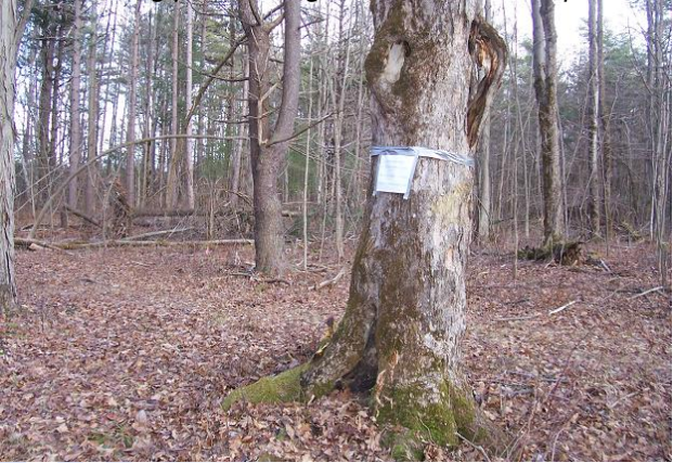
The old 'Maple Tree' junction.