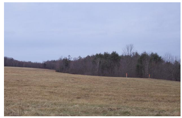
Staking posts along the Blue Heron Airport