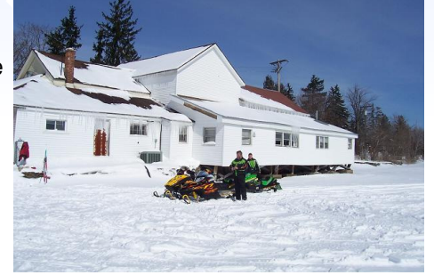
warm Mariaville Country Store and Pizza this winter.

Up on top of the hill you will find another trail intersection. Following the signs to