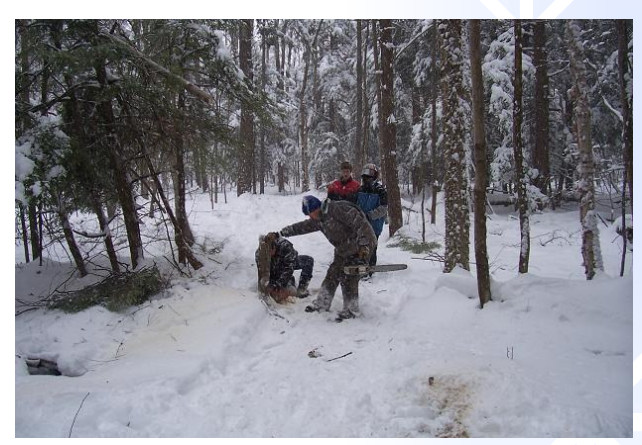
The crew cuts groomer grabbing stumps.